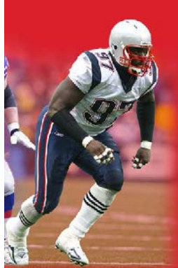
JARVIS GREEN Former Defensive End New England Patriots

July 6 – 8, 2020 • UMass–Lowell, Lowell, MA