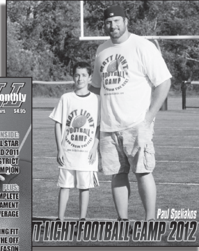
Poster Magazine Cover